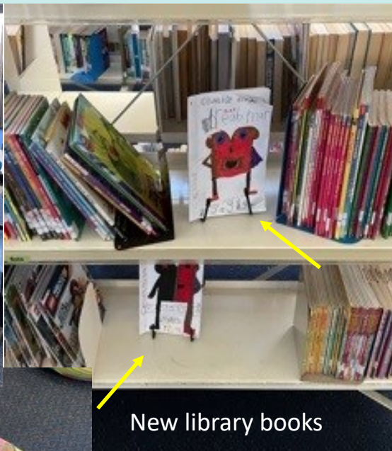
New library books